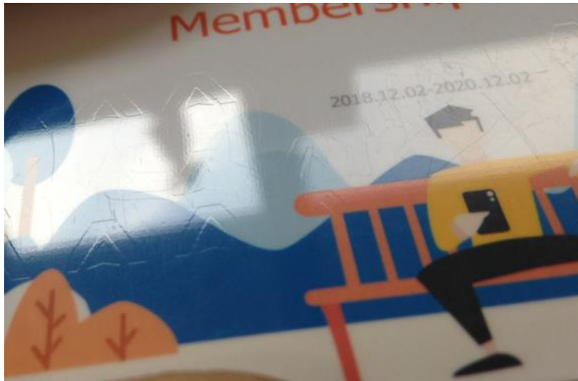
The custom watermark image is shown above. Watermarking is a great security advantage available on our specialty ribbons.

Alternatively, a bitmap image can be printed using one of the overlay panels. This creates a watermark image on the card, which can be an effective security feature. The bitmap image is selected in the driver from images on the PC. It must be a monochrome bitmap file with a resolution of 1016 x 656. Watermark images can be printed on one or both sides of the card if using a dual-sided printer. The same or different images can be printed on the front and back of the card.